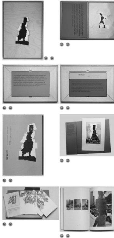
Total images: 8